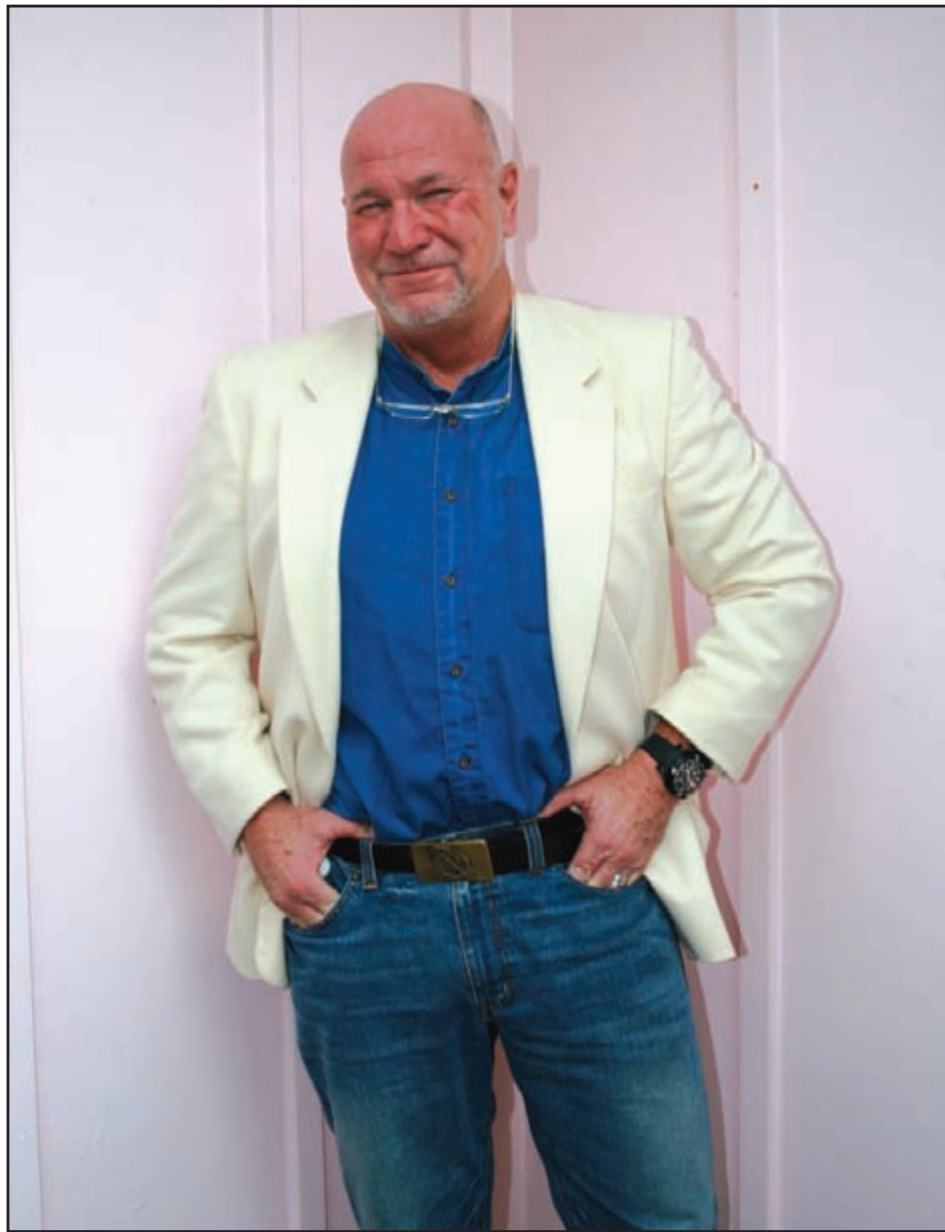
Randy Wayne White